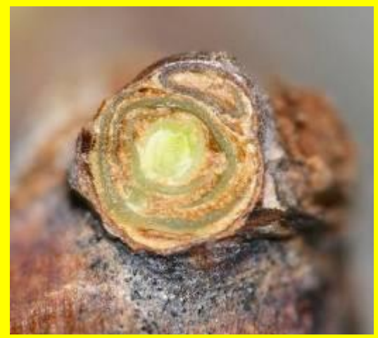
A cross section of a dormant bud. The three buds within the compound bud can be seen.

If the primary bud dies, the secondary bud activates. If both primary and secondary buds die, the tertiary bud activates. From the cold last winter we lost on much of our grapes all primary buds and large portions of secondary buds, therefore small crop. Is there an upside to this? Yes, with the small crop load the vines should be in good condition for the upcoming winter and in good health to carry a large crop load next summer. What we need now is a more normal winter.